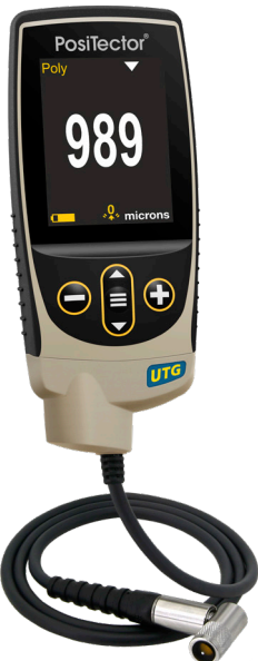
PosiTector UTG P1