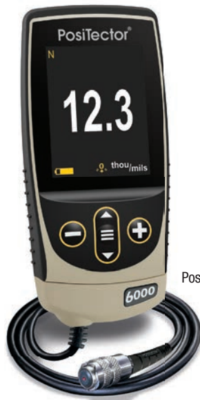
PosiTector 6000 NS3