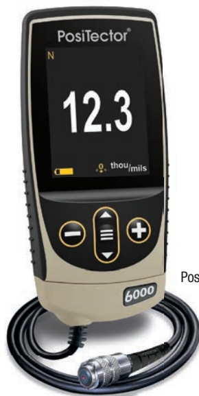
PosiTector 6000 NS1