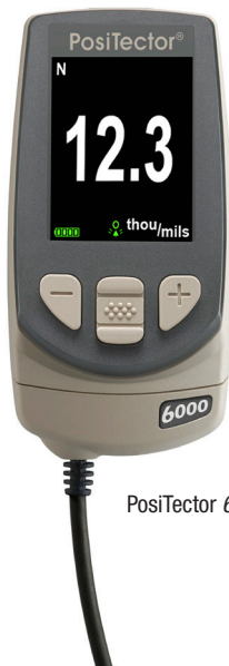
PosiTector 6000 NRS1