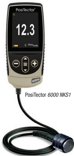
PosiTector 6000 NKS1