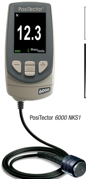
PosiTector 6000 NKS1