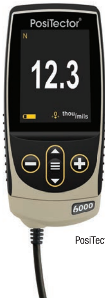
PosiTector 6000 N45S3