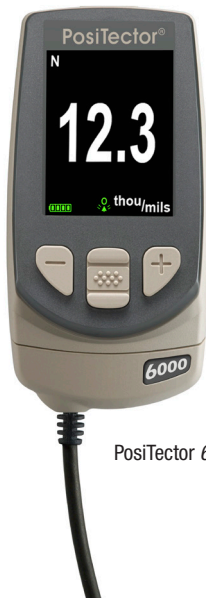
PosiTector 6000 N45S1