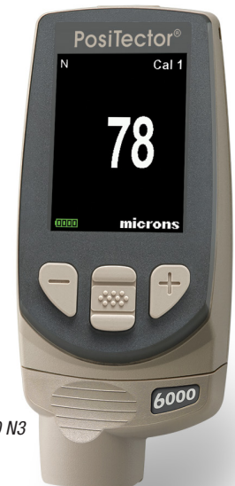
PosiTector 6000 N3

N probe for for measuring non-conductive coatings on non-ferrous metal substrates (aluminum, copper, etc.). Ideal for one-handed operation.