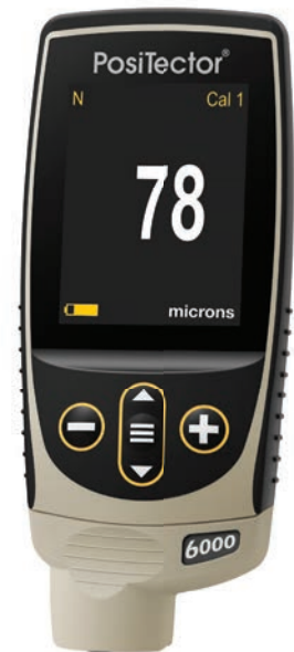
PosiTector 6000 N3