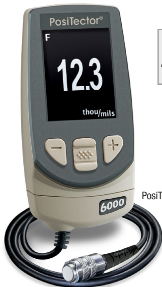
PosiTector 6000 FXS3