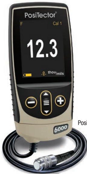
PosiTector 6000 FXS3