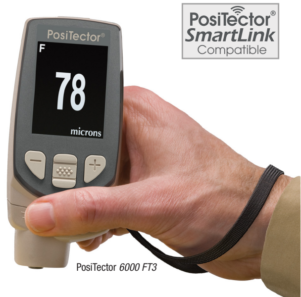
PosiTector 6000 FT3

FT probe for measuring thick protective coatings on steel substrates. Ideal for thick epoxy, rubber, intumescent fireproofing and more.