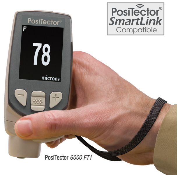
PosiTector 6000 FT1

FT probe for measuring thick protective coatings on steel substrates. Ideal for thick epoxy, rubber, intumescent fireproofing and more.