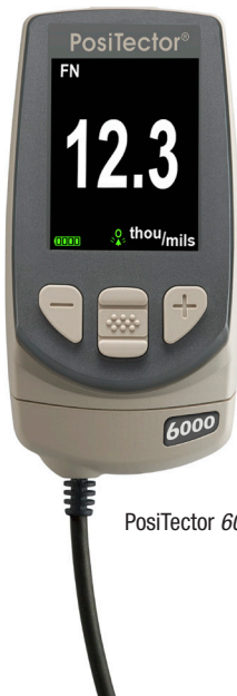
PosiTector 6000 FNGS3