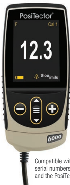
PosiTector 6000 FNGS1

Compatible with PosiTector bodies with serial numbers greater than 700,000 and the PosiTector SmartLink.