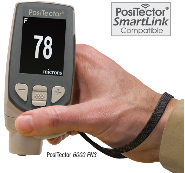
PosiTector 6000 FN3

FN probe for measuring coating thickness on ferrous and non-ferrous metal substrates. Ideal for measuring coating thickness on steel, iron, aluminum, copper and more.