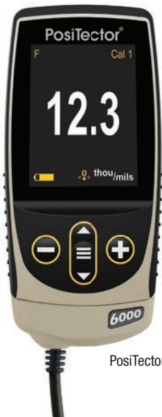
PosiTector 6000 FLS3