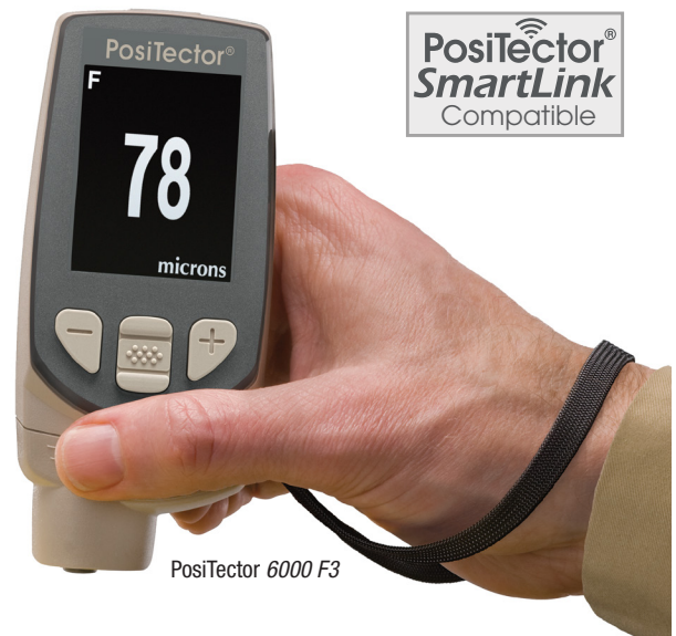
PosiTector 6000 F3

F probe for measuring non-magnetic coatings on steel substrates. Ideal for one-handed operation.