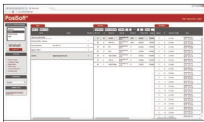
Jobs Batches Readings