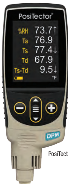
PosiTector DPM 3