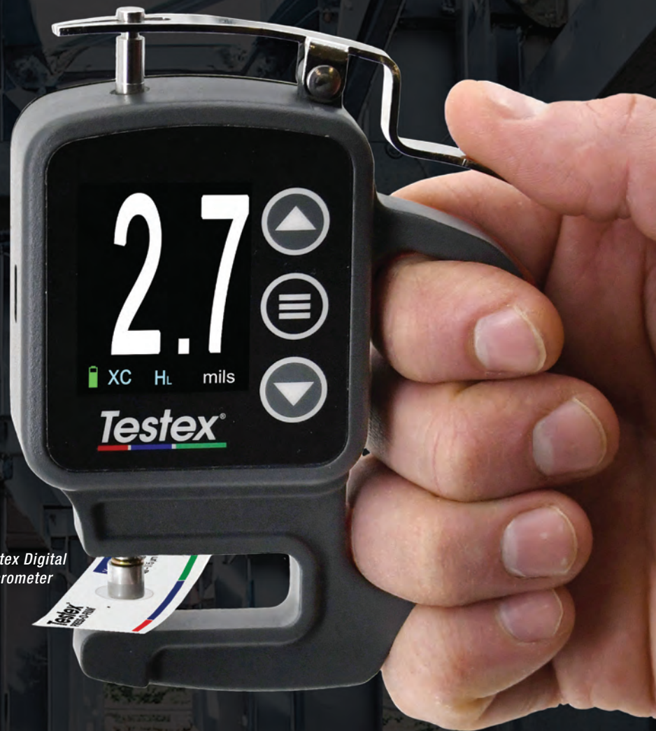
Testex Digital Micrometer

Measures surface profile by creating a replica of the surface, which can be measured using a micrometer