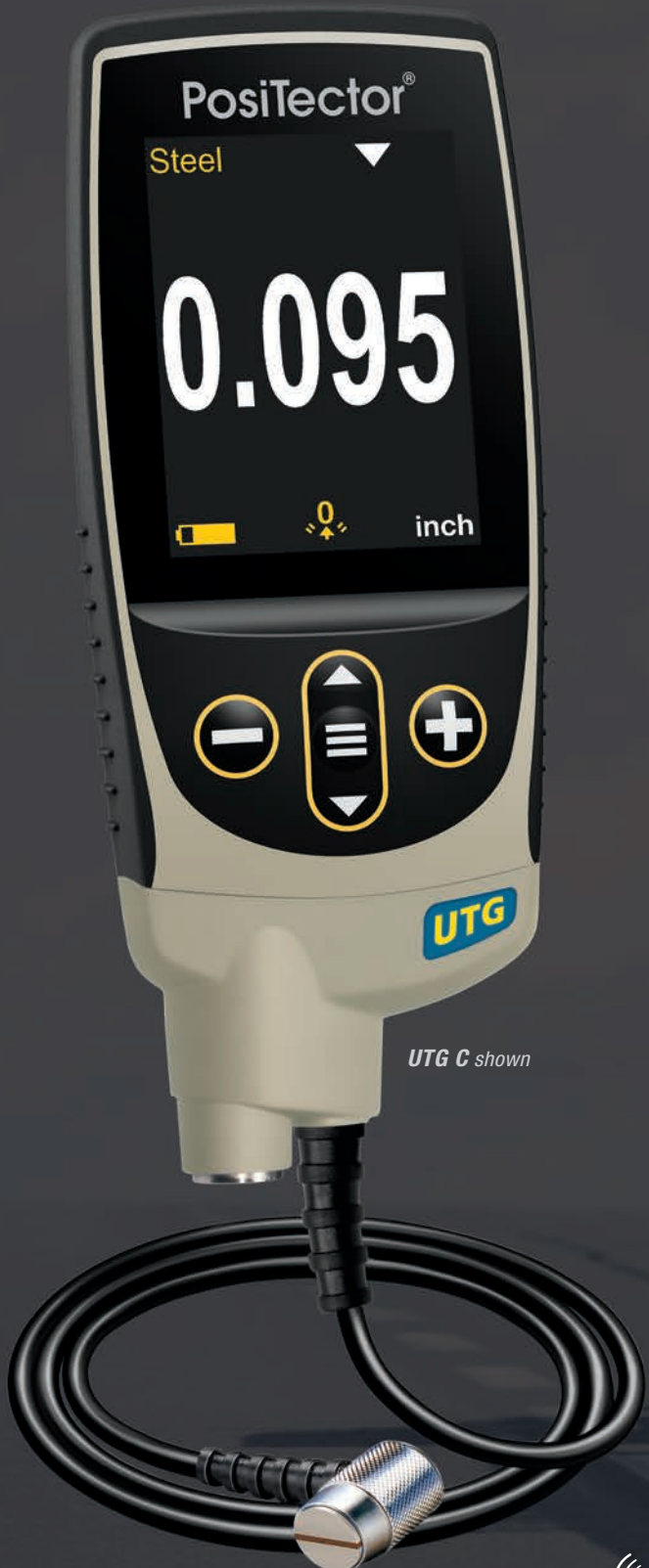
UTG C shown

Measures the remaining wall thickness of cargo tank shells and heads used in the transportation of corrosive or hazardous materials