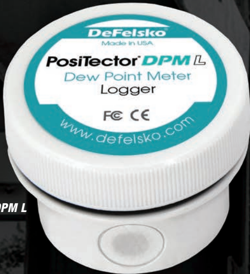
PosiTector DPM L