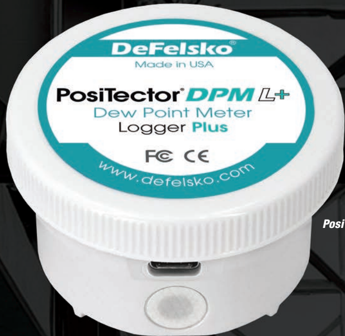
PosiTector DPM L+