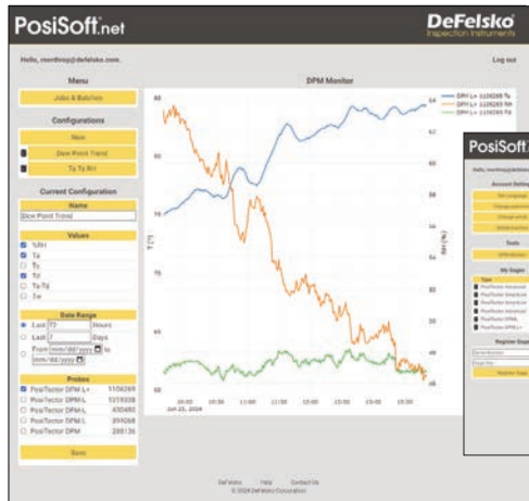
Easily spot trends and analyze large batches of data

(PosiTensor DPM L+ only) Continuously upload readings to PosiSoft.net using a WiFi connection, to remotely monitor job site conditions from anywhere using a PC or Mac