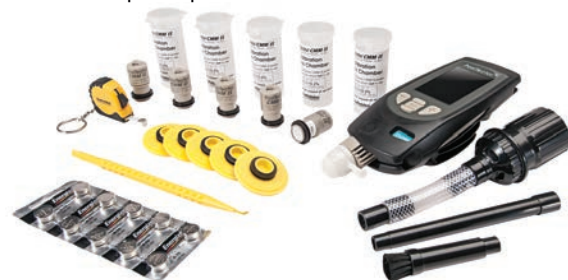
PosiTector CMM IS Pro Kit includes the PosiTector DPM Advanced

Replacement chambers, salt solutions, tools, caps and fins are available upon request